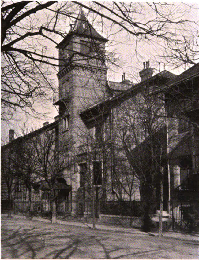
LESCHETIZKY'S HOUSE IN VIENNA